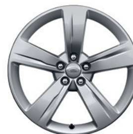
19" 5 SPOKE 'STYLE 5046'

Distinctively designed and superbly engineered, our wheels are available in a choice of designs, fully fitted, aligned and balanced.