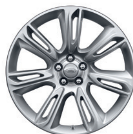
20" 7 SPLIT-SPOKE 'STYLE 7014'