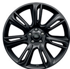
20" 7 SPLIT-SPOKE 'STYLE 7014' WITH GLOSS BLACK FINISH