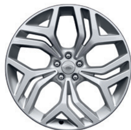
21" 5 SPLIT-SPOKE 'STYLE 5047'