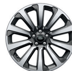
20" 10 SPOKE 'STYLE 1032' WITH DIAMOND TURNED FINISH