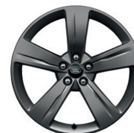
19" 5 SPOKE 'STYLE 5046' WITH SATIN DARK GREY FINISH