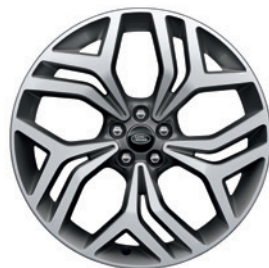
21" 5 SPLIT-SPOKE 'STYLE 5047' WITH DIAMOND TURNED FINISH