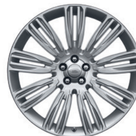
22" 9 SPLIT-SPOKE 'STYLE 9007'