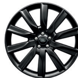
21" 10 SPOKE 'STYLE 1033' WITH GLOSS BLACK FINISH