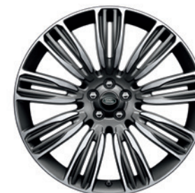
22" 9 SPLIT-SPOKE 'STYLE 9007' WITH DIAMOND TURNED FINISH