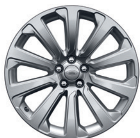
20" 10 SPOKE 'STYLE 1032'