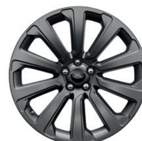
20" 10 SPOKE 'STYLE 1032' WITH SATIN DARK GREY FINISH