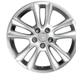
19" 5 SPLIT-SPOKE 'STYLE 5001' WITH SILVER FINISH (1)

Sizes range from 19" to the highly desirable 22". With distinctive design cues, each one adds its own character to the overall look of the vehicle.