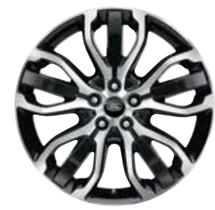
21" 5 SPLIT-SPOKE 'STYLE 5007' WITH GLOSS BLACK DIAMOND TURNED FINISH