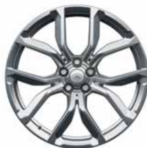
22" 5 SPLIT-SPOKE 'STYLE 5083' WITH SATIN POLISH FINISH