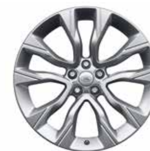
22" 5 SPLIT-SPOKE 'STYLE 5086' WITH SILVER FINISH (1) (4) (6)