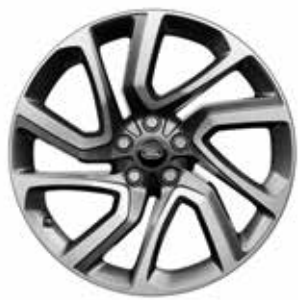
21" 5 SPLIT-SPOKE 'STYLE 5085' WITH DIAMOND TURNED FINISH