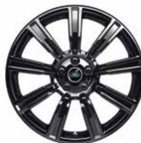
21" 9 SPOKE 'STYLE 9001' WITH GLOSS BLACK FINISH (2)