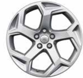
20" 5 SPLIT-SPOKE 'STYLE 5084' WITH SILVER FINISH