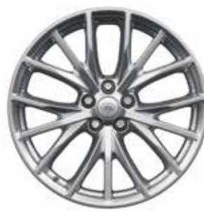
21" 5 SPLIT-SPOKE 'STYLE 5091' WITH SATIN POLISH FINISH