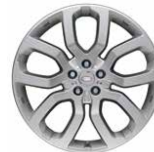
22" 5 SPLIT-SPOKE 'STYLE 5004' WITH SILVER FINISH (1)