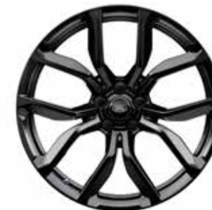
22" 5 SPLIT-SPOKE 'STYLE 5083' WITH GLOSS BLACK FINISH