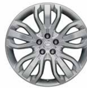
21" 5 SPLIT-SPOKE 'STYLE 5007' WITH SILVER FINISH