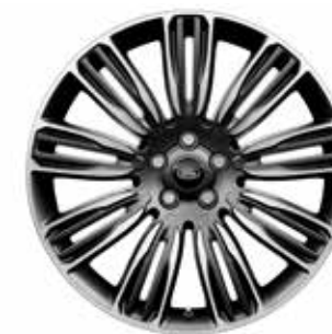
22" 9 SPLIT-SPOKE 'STYLE 9012' WITH DARK GREY DIAMOND TURNED FINISH (1)