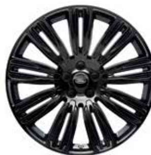
22" 9 SPLIT-SPOKE 'STYLE 9012' WITH GLOSS BLACK FINISH (1) (2)