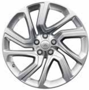
21" 5 SPLIT-SPOKE 'STYLE 5085' WITH SILVER FINISH